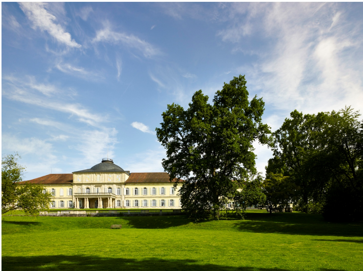
University of Hohenheim