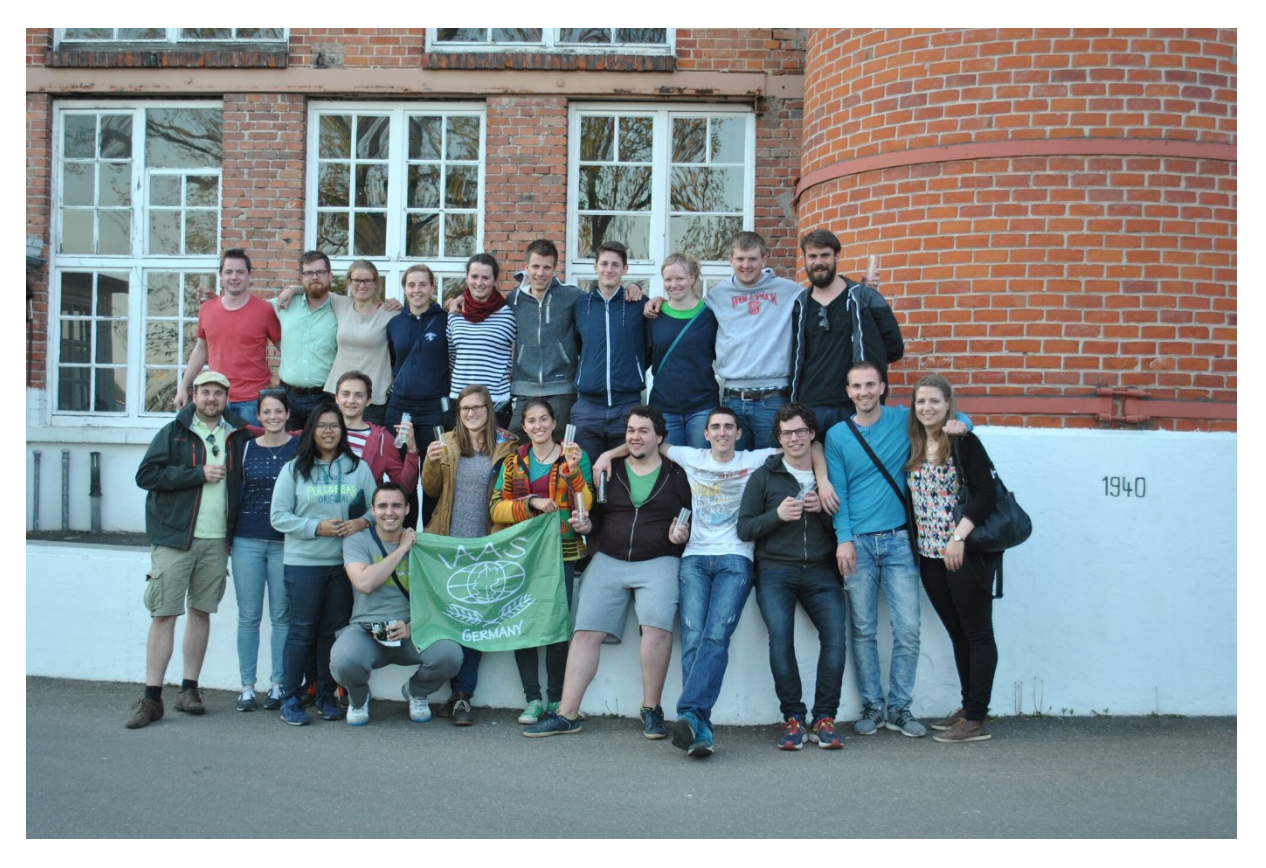
Saturday, May 7th "Time to say goodbye"

On Saturday it was time to say good bye. Let's hope that the proverb "You always meet twice in a lifetime" is true. We all came from different countries for an exciting seminar about agriculture and in the end left as friends, we will truly miss.